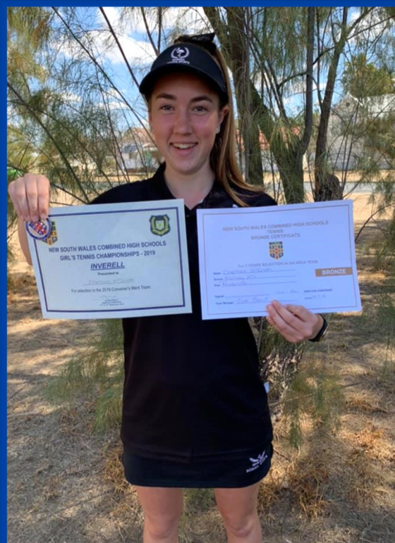
CHELSEA WITH HER SILVER MEDAL, BRONZE CERTIFICATE AND MERIT AWARD