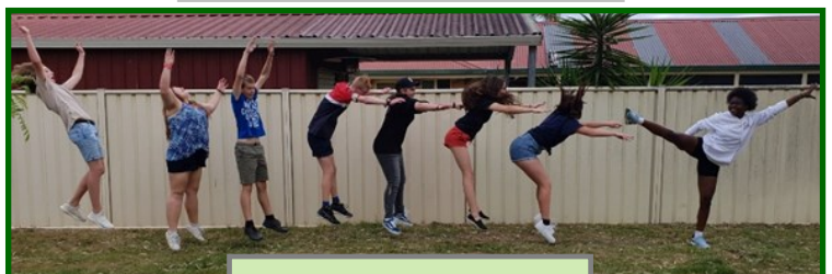
If one falls, we all fall.