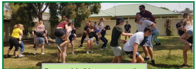
Teamwork builds on our strengths

Students participated in a range of activities aimed to build relationships, strengthen their skills and develop empathy. Both teachers and students had a great time working together to build a positive environment for our school.