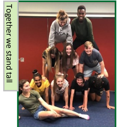
Together we stand tall