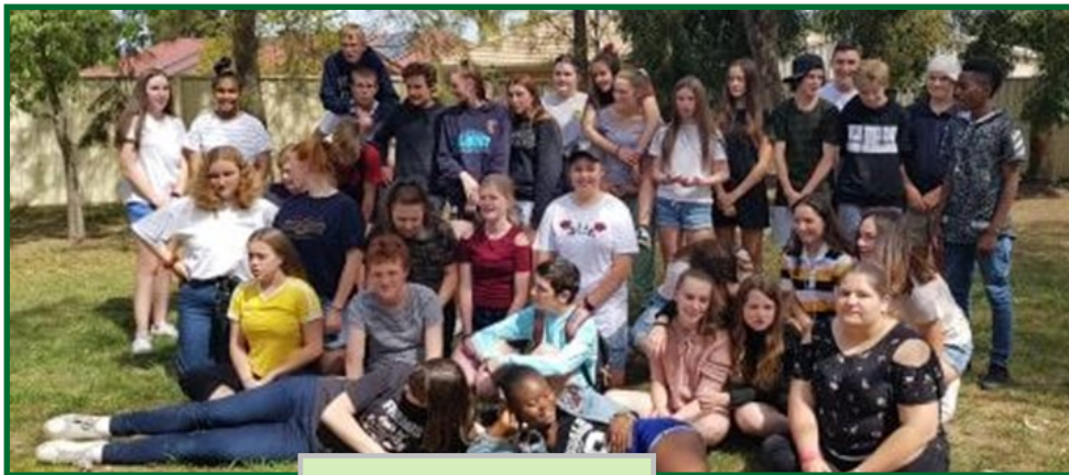
2019 Peer Support Leaders