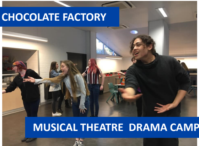
MUSICAL THEATRE DRAMA CAMP