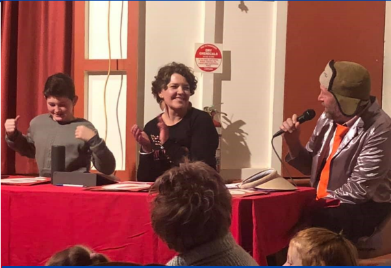
BURRUMS GOT TALENT