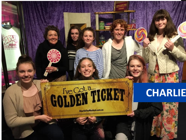
CHARLIE AND THE CHOCOLATE FACTORY