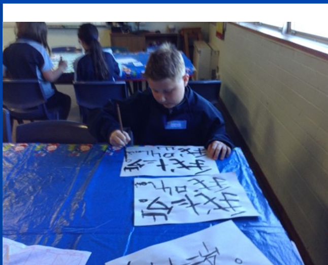
LOUIS'S GORGEOUS CALLIGRAPHY